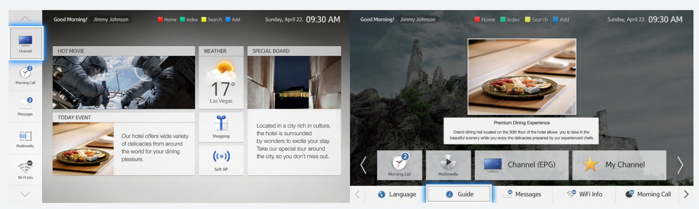
Figure 2. The REACH UI can be customized to provide hotels with a look uniquely their own

To further customize in-room content for guests, REACH offers additional conveniences for the hotel manager, such as creating content for specific groups of guests. Various guests can be assigned to groups that have similar sets of channels and content needs. Managers can create up to 10 groups of displays with dedicated content for each group, which is ideal for targeting a specific group of guests such as convention attendees.