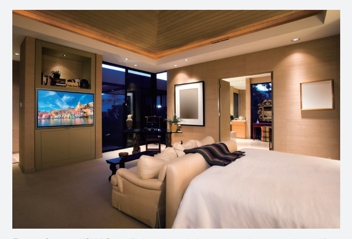
Figure 1. Samsung HC770 Series displays elevate the in-room entertainment experience while enhancing the guest room's ambiance

High-quality displays in guest rooms can contribute to an enjoyable hotel stay. With the elegant design of Samsung HC770 Series ultraslim displays, hoteliers can elevate guests' viewing experience. Light and unobtrusive, the displays feature a narrow bezel, providing more viewing area. The displays boast an ultra-slim form factor that provides hotel guests with a richer viewing experience and a more elegant in-room atmosphere.